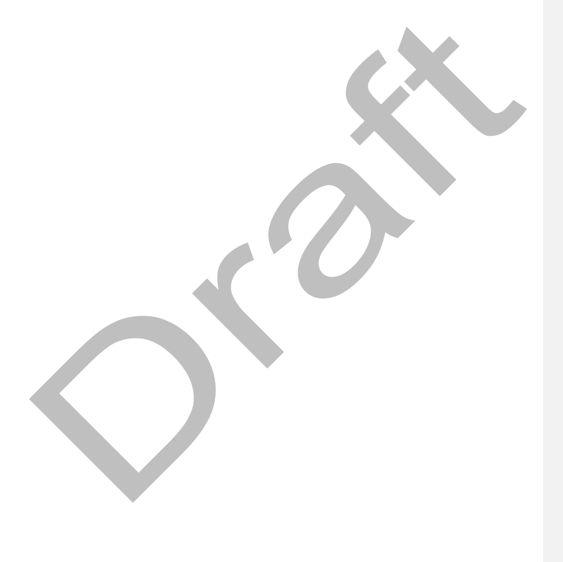
Page | 31

band D Shared Ownership only. No person with this banding can be offered social or affordable rented accommodation.